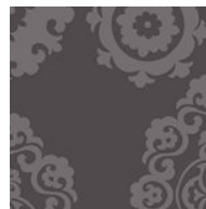
Embossed Mirage (pewter) #2SSC-3005-8