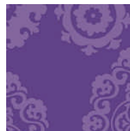
Embossed Mirage (jewel) #2SSC-3005-2