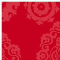
Embossed Mirage (crimson) #2SSC-3005-5